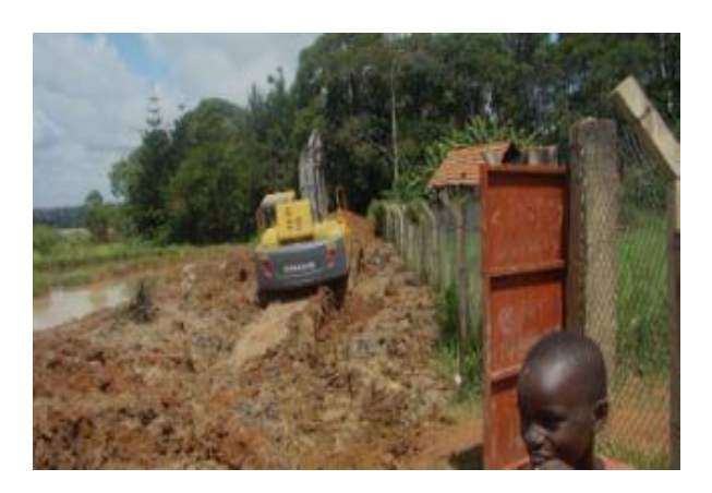
Deepening the ponds

The deepening of the ponds was carried out but operations of the excavator were seriously affected by the very soft clayey soil around the ponds. Two of the original ponds were expanded and deepened to accommodate upwards of 14 standard size cages that can potentially hold up to 14,000 fish at a time. The edges of the pond were trimmed and properly aligned when the excavated mud around the pond sufficiently hardened to allow safe access. Below are some photos highlighting the rehabilitation.