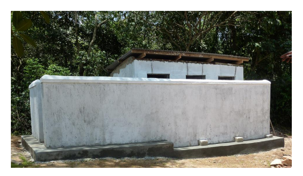
The Sanitary Facility for the Boys