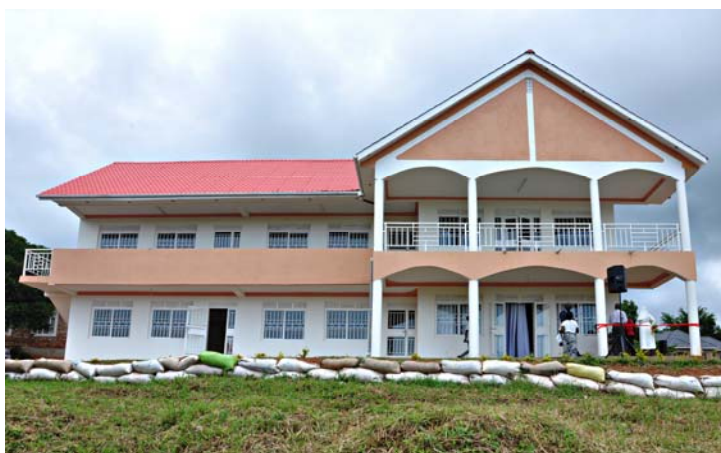
Opening of Elizabeth Residence, 2013