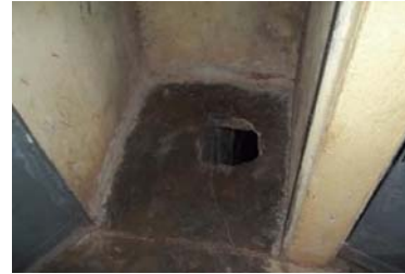
Slab of main Latrine (sagging)