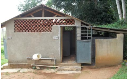
The main latrine and bathrooms