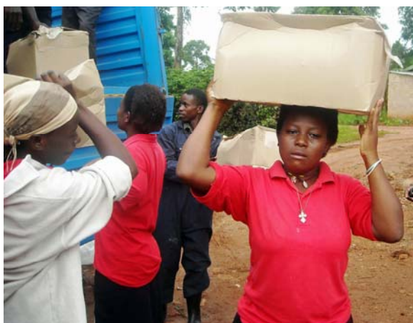
Unloading the Lee Valley Tools container, 2010

CANHAVE supports 60 AIDS-affected orphans. A container of Lee Valley-collected tools and much more arrives in Uganda. Evaluation of the Children's Program takes place in Canada and Uganda.