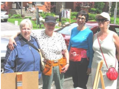
Volunteers at the Great Glebe Garage Sale.