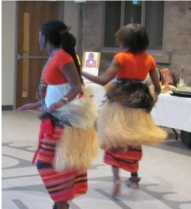
Dancers from the Ngoma troupe at the 20 th anniversary reception.

At 20, CANHAVE proudly boasts wonderful volunteers in the Ottawa area and in Uganda. We want you to help us thank them at the celebratory dinner and through donations to CANHAVE.