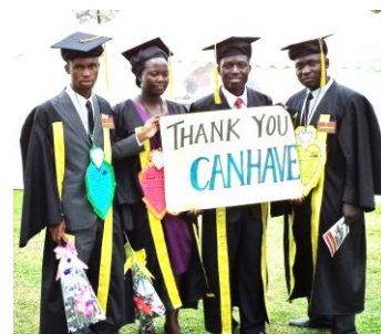
Vocational School Graduation 2013.