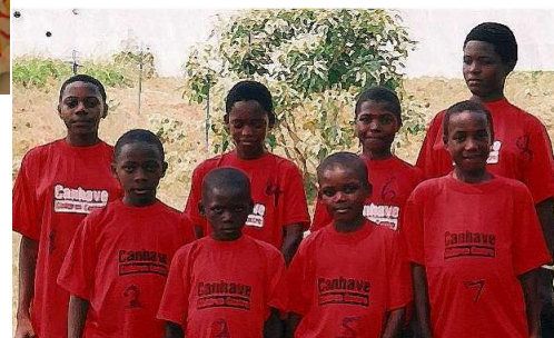
Some of the original pioneer students in CANHAVE T-shirts.

The gifts of many very generous donors enabled CANHAVE to fulfill its dream of a safe and comfortable girls' dormitory. Elizabeth Residence officially opened in 2013.