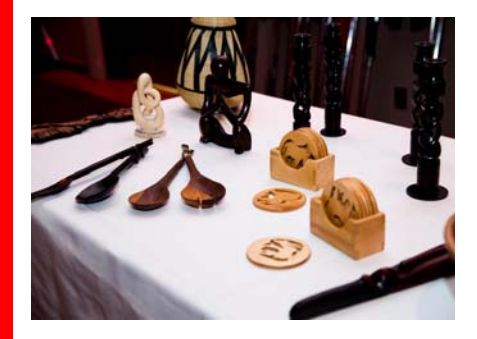
Some of the auction items

Entertainment: Drums of Africa Kiganda Dancers and the River Jordan Children's Choir