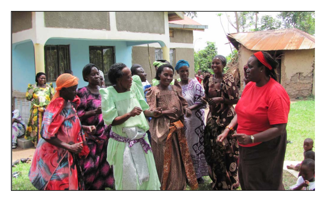
A Sunday afternoon celebration at KWEEG

KWEEG brings together women, who work to empower and encourage and support each other in the fields of Education, Health Services and Small Business.