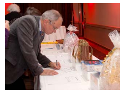
The Auction table