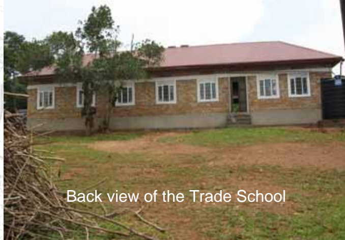
Back view of the Trade School

I extend my hearty congratulations to all and look forward to stronger performance, results and higher productivity in the years ahead as we deliver CanHave programs.