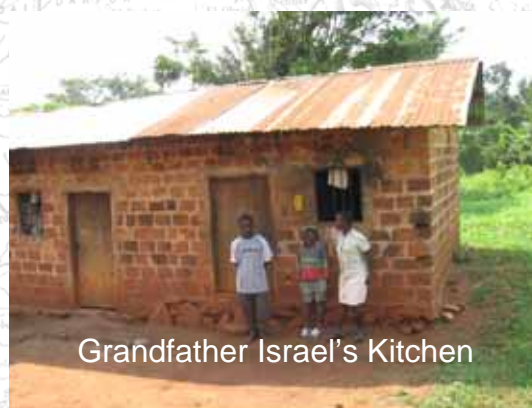
Grandfather Israel's Kitchen