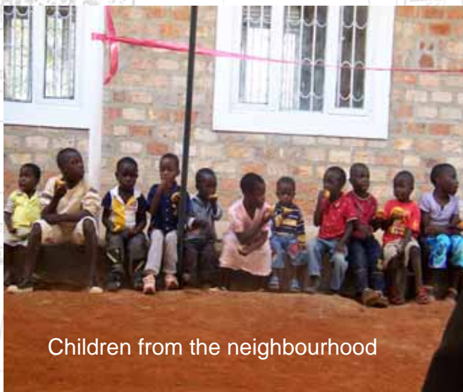
Children from the neighbourhood

As supporters, we ask you seriously to consider making a contribution to the evening through an item or items for the silent auction or through the creation of a gift that will be raffled. All the funds go directly to the education and support of the 50 Ugandan CanHave children or to the CanHave Trade School. You may choose which program you wish to assist.