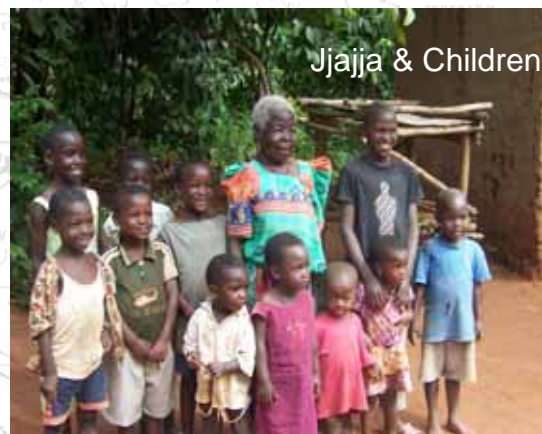
Jjajja & Children

We were also privileged to meet some absolutely exceptional people, Ugandans who know well the plight of parentless children and who are doing all they can to help them. Uganda is called the 'Pearl of Africa'. I would call these people the true pearls of Uganda.