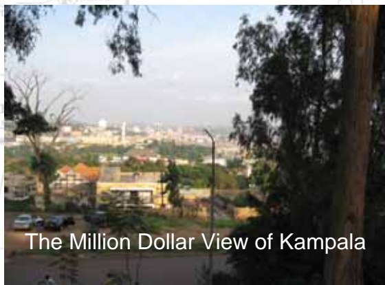
The Million Dollar View of Kampala

We can even hear the call of the mosque. Everything is a little strange.