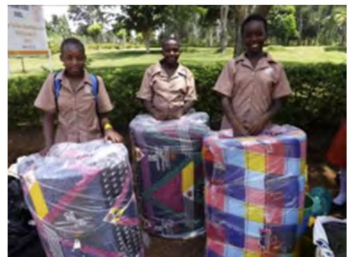
Three CANHAVE girls with their bedding, arriving at St. Elizabeth's Girls School at the beginning of term.

The evaluation process has already identified that boarding students lacked necessities like suitcases, mattresses, and mosquito nets. To address the problem, proceeds from the sale of locally grown vegetables now provide funding for such items.