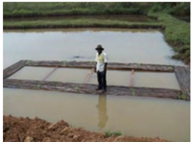
The new fishponds and cages.