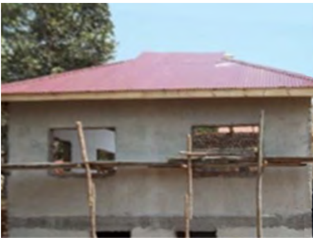
The new two-storey kitchen.