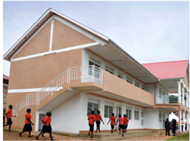
The Elizabeth Residence at the CANHAVE Vocational School

In 2016, CANHAVE did not send operating funds for the school. The CANHAVE Canada Board did, however, promote other necessary capital improvements. Thanks to the amazing response of our supporters, major work has gone into several projects from late 2016 through early 2017: