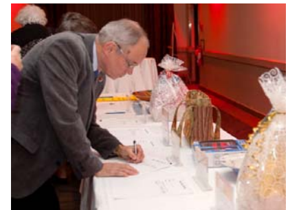
The Auction table