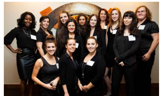
Volunteers from Algonquin College