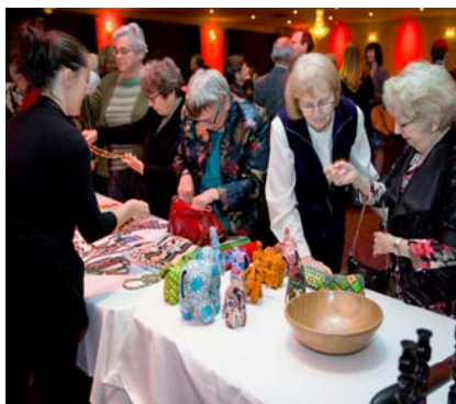
The "African Jewelry" table, made and donated by WAVE, (Work and Volunteer Experience for Adults with Autism).