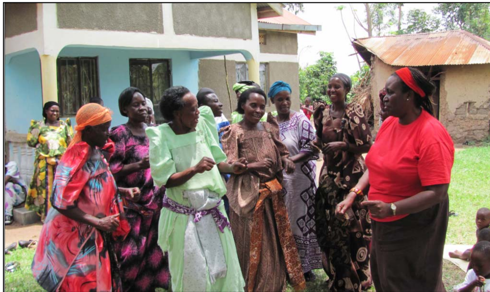
A Sunday afternoon celebration at KWEEG

KWEEG brings together women, who work to empower and encourage and support each other in the fields of Education, Health Services and Small Business.