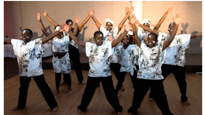
Entertainment: Drums of Africa Kiganda Dancers and the River Jordan Children's Choir