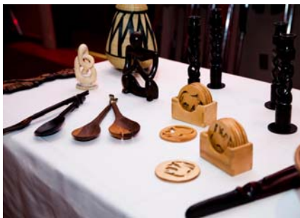
Some of the auction items