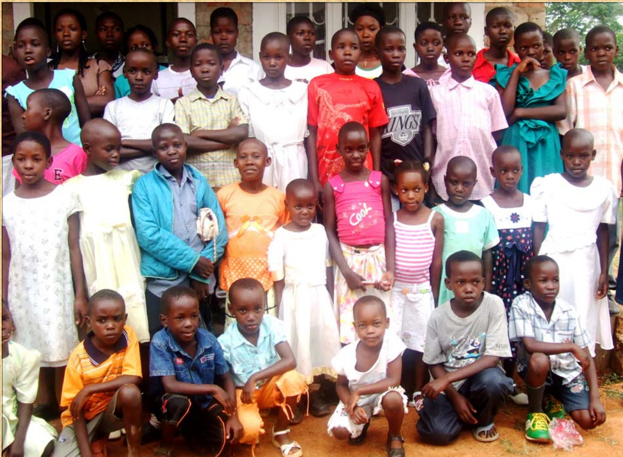
CanHave children gather at the Trade School for the 2008 Christmas party