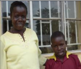
One of our CANHAVE students selected for schooling

The Ottawa Board is striving to raise funds for a permanent girls dormitory, container transportation of tools to the Trade School, fence around the property, tuition fees paid for gifted students, new desks and chairs and to increase our sponsorship of CANHAVE children to 70.